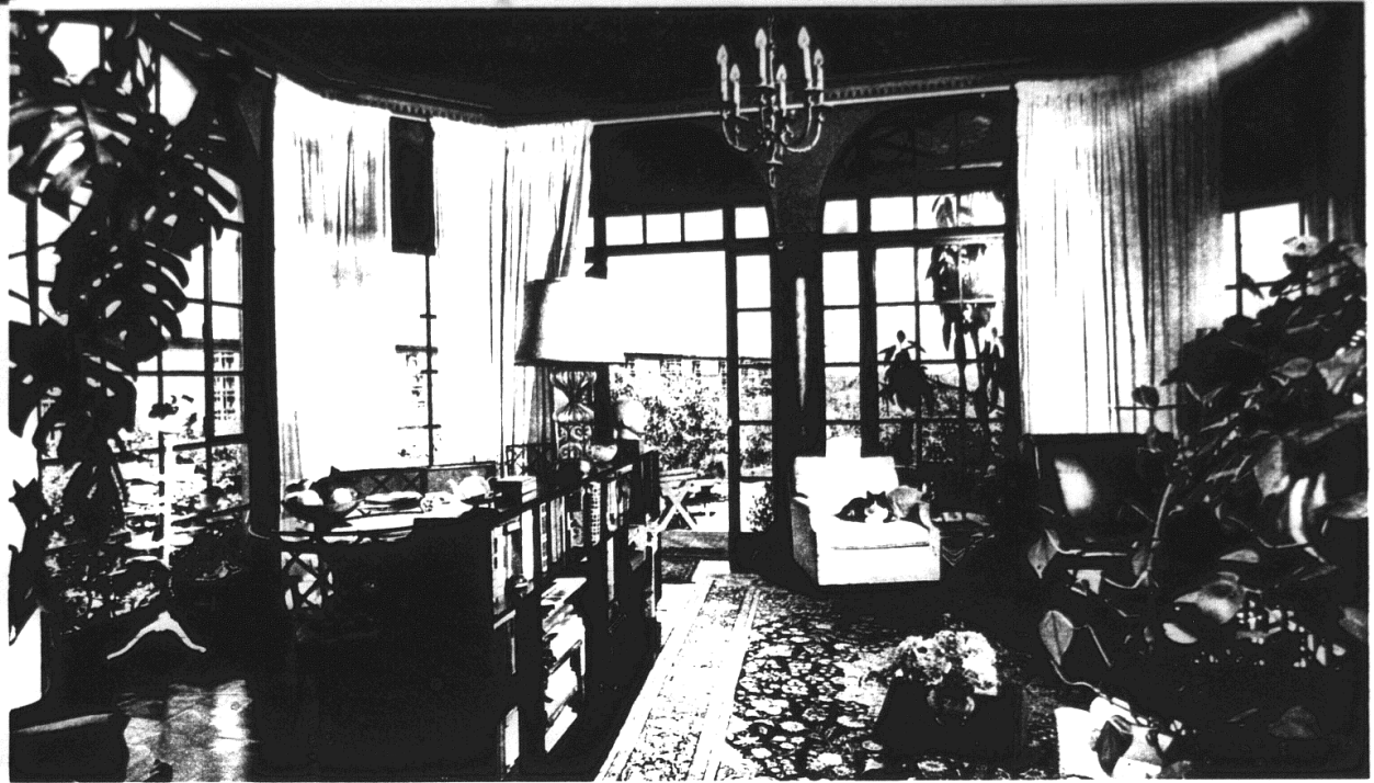
Octagon-shaped living room has 200 window panes in its floor to ceiling glass walls, has gilded pillars at garden doorway. Mrs. van Eckhardt finished bookcases that act as room divider