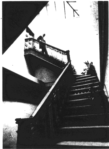
Plant-flanked staircase entices many curious visitors up to penthouse. Some want to eat lunch on the roof, others want to rubberneck at the view