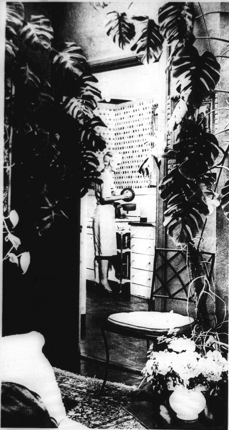
Phelan penthouse's skinny kitchen opens from foyer, offers rooftop views. Beyond it is the compact bedroom. Limited storage space is augmented by using part of the elevator housing structure outside